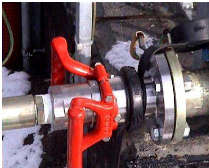
Figure 2: Dry disconnect system