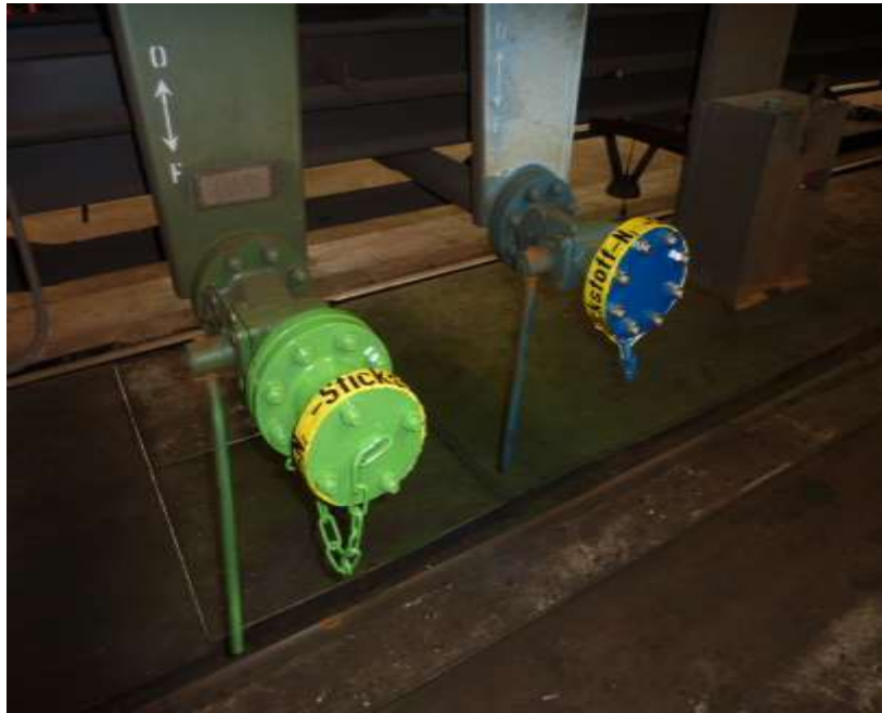
Figure 1: Flanged connection

Photographs of three types are attached.