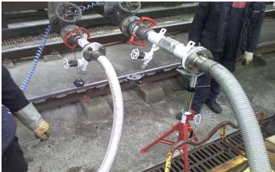
Figure 9: Example of connector (dry disconnect coupling to flange, mounted to unloading arm)

Currently, supplier and client do not always have the same type of connection. So for instance railcar of supplier might be equipped with dry-disconnect seal, whereas the hose of the client is equipped with flange system. An example of a connection piece that is given by supplier to downstream client in such case is shown in Figure 9. A proper risk analysis should be done when using adapter.