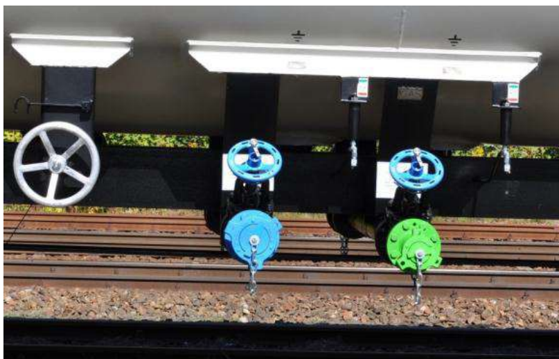
Figure 3: Screw type connection

Total production of crude C4 from steam crackers in EU-15 is about 6.4 Mton, total production of butadiene is about 1.9 Mton (Cefic data for 2015).