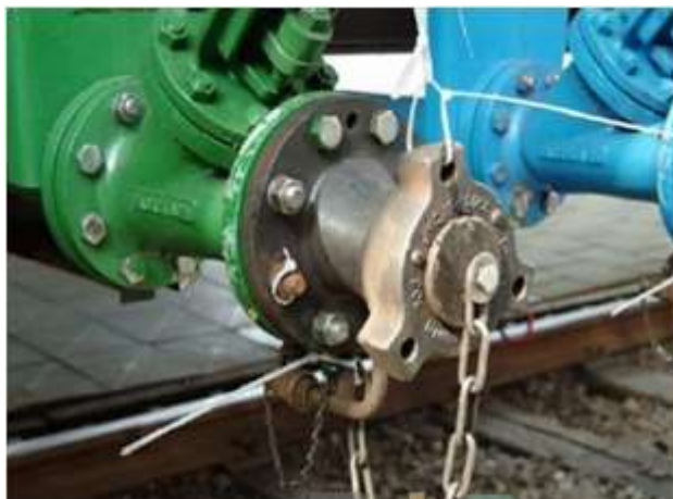
Figure 6: example of WECO connection mounted on flange.

As for flanges, most of these disadvantages can be taken care of by taking appropriate measures, but reality does not always equal the best practice, and mistakes can be expected to occur.