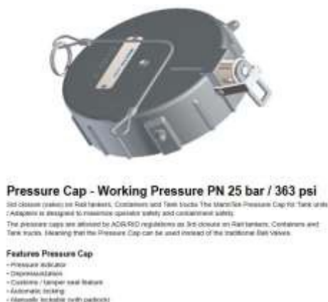
Figure 8: Pressure cap for installation on dry disconnect coupling

It is also recommended to install a plastic cap to protect against dirt. Alternatively, one can also install a metal cap on the dry-disconnect coupling (see Figure 8). This can act as a “leak-detection of the valves” and acts as an extra closure according to RID.